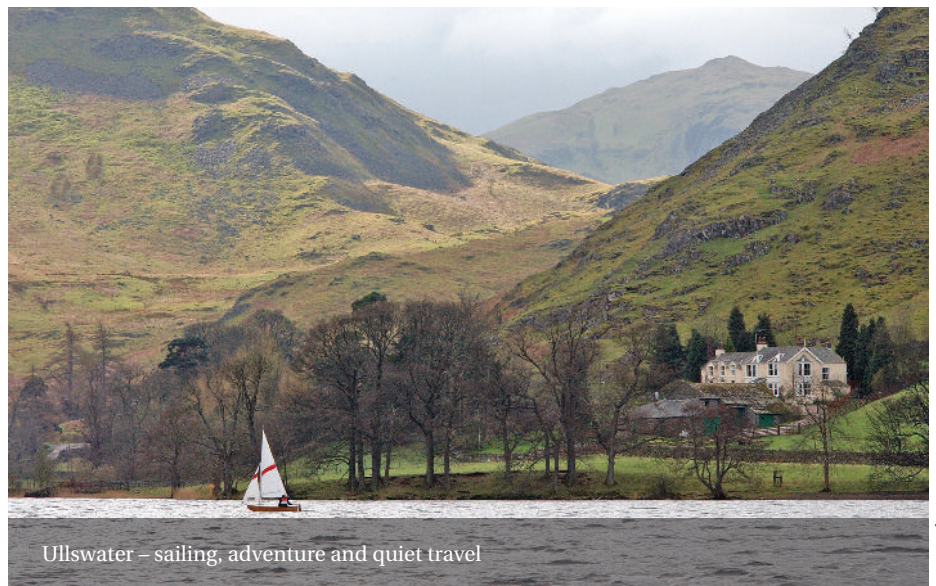
Ullswater – sailing, adventure and quiet travel