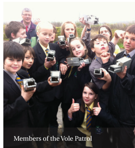
Members of the Vole Patrol