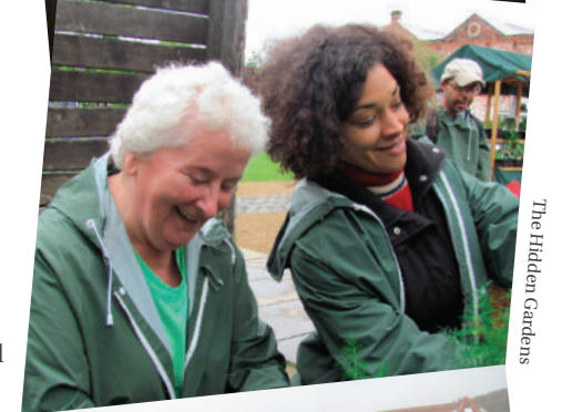
The Hidden Gardens