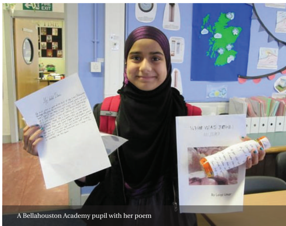
A Bellahouston Academy pupil with her poem