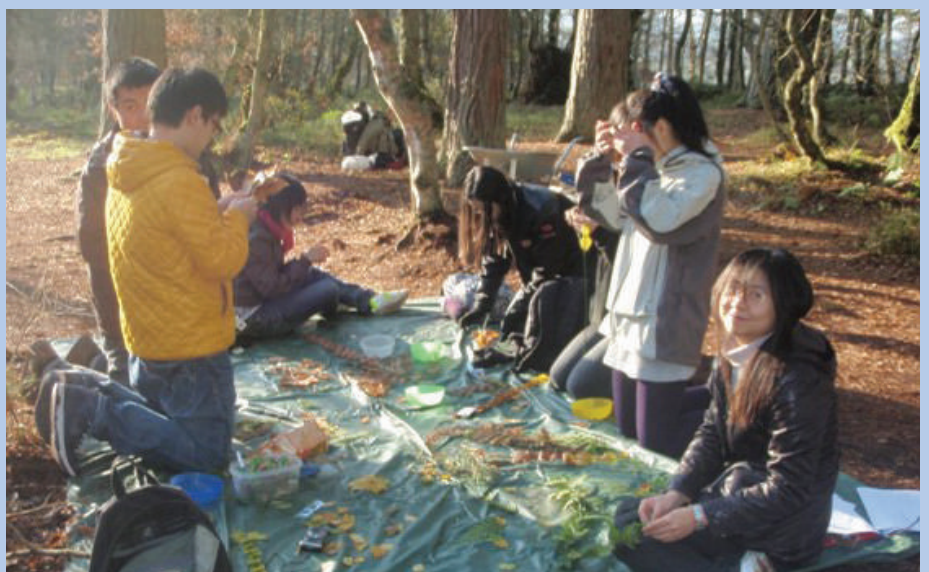
International student volunteers from Newcastle University

To see more visit rupertswood.co.uk/#/john-muir-award/4558096079