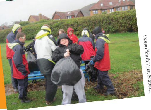
Ocean Youth Trust Scotland