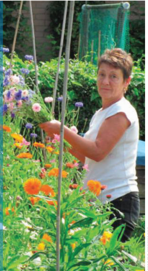
The Hidden Gardens