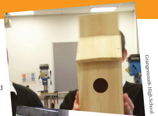
Grangemouth High School