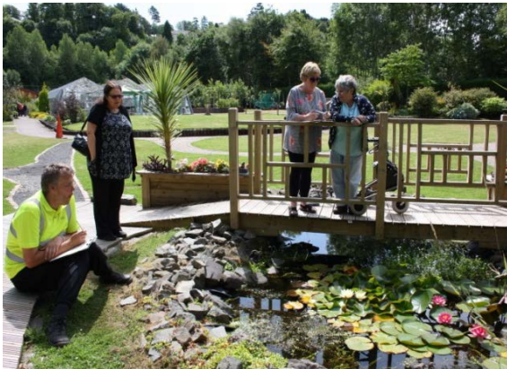
Participants observe & record the sights and sounds of the beautiful pond area, where their poetry will be displayed.

Participants’ hard work will have a creative legacy at Parklea Branching Out, with plans to produce glass panels displaying pebble poetry created by the group, forming a permanent record of the heartfelt emotions the learners expressed in appreciation of Parklea’s beautiful natural environment. Seeing tangible outcomes of their work becoming important parts of the garden’s development has helped the group take pride in their achievements, building their sense of belonging and ownership in their local environment.