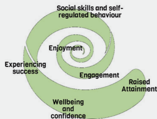
Figure 1: The pathway to raised attainment through outdoor learning, Natural England 2016 Search 'Transforming Outdoor Learning in Schools'

Evidence highlights that securing pupils' interest and engagement with learning through outdoor approaches has a part to play in raising attainment. It has wide-reaching and positive outcomes for pupils and teachers, including: improved relationships, behavior and attendance; enhanced health and wellbeing; enjoyment and engagement in learning. These are seen as foundations to successful learning (see Natural Connections diagram below).