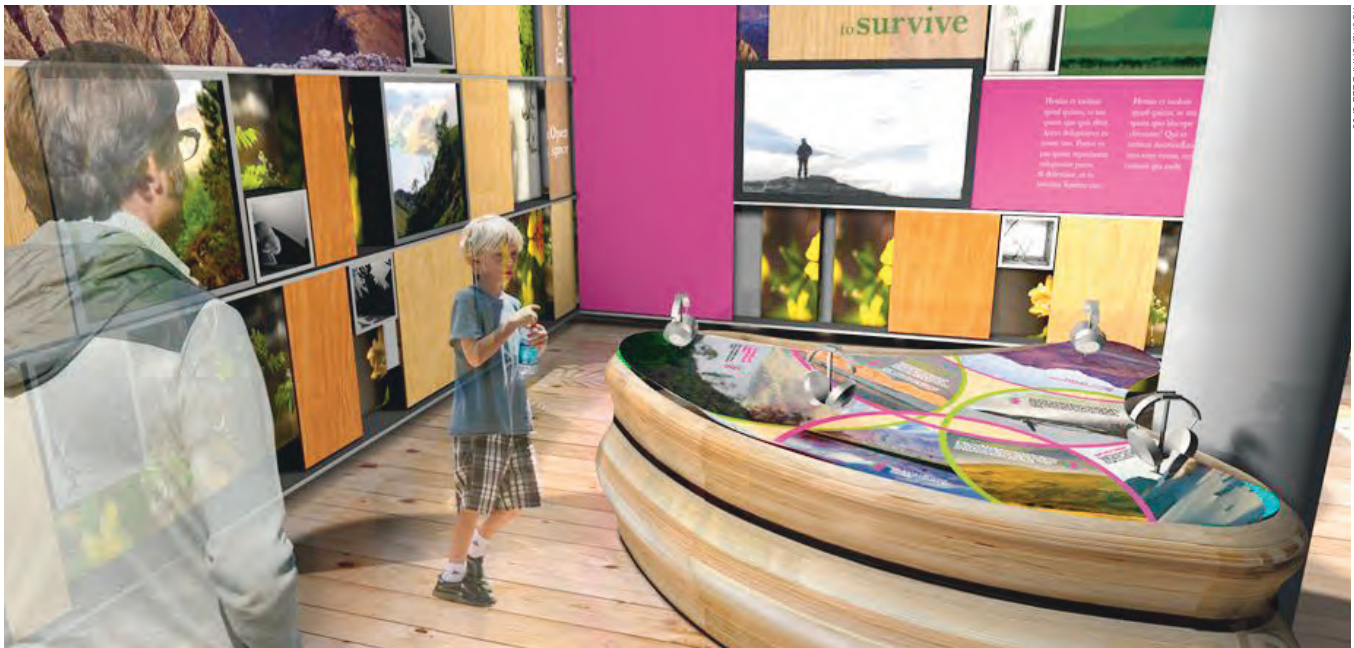
An artist's impression of the Trust's new Wild Space exhibition area

If everything continues to go to plan, we look forward to welcoming you to our Wild Space by Easter 2013.