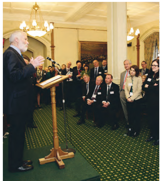
Sir Chris Bonington addresses the reception audience