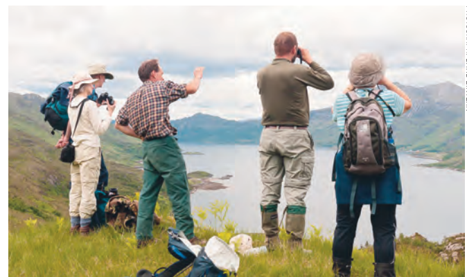
Participants on a recent Wild Day in Knoydart