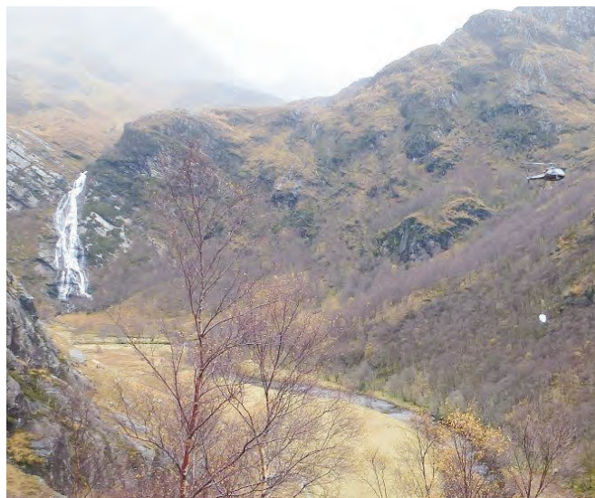
The helicopter had to negotiate some extremely tricky terrain (top); working amidst dramatic scenery (below)