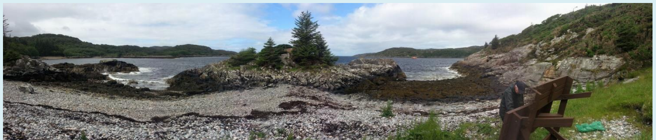
Above painting a bench at White Shore beach in Culag Woodland, below (l) laying grass at Talla na Mara community centre in West Harris, below (r) collecting alder seed in the Ettrick Valley for Glenlude tree nursery

"Do something for wildness and make the mountains glad" (John Muir, 1892)