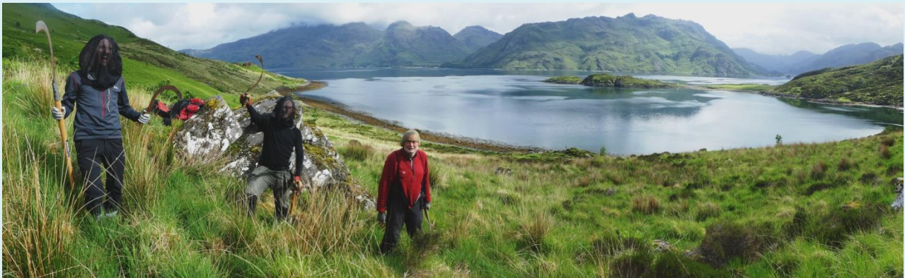
above Preparing to clear bracken around trees at Li & Coire Dhorrcail below path maintenance on East Schiehallion

The number of work days achieved in the main programme was very similar to 2016 with an average work party consisting of ten people but due to the informal way that they are run (people look after their own travel and accommodation) people do drop in and out, usually to fit in hill walks or bags!