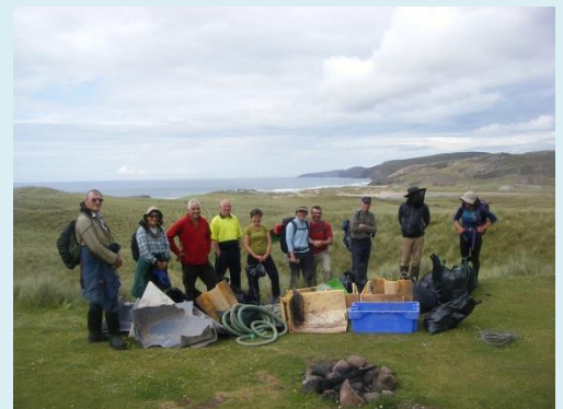
Top path work on East Schiehallion (l) and Sligachan, Skye (r) middle, Sandwood Bay bottom, beach cleaning on Tanera Mor (l) Sandwood Bay (r)