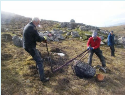
Path work on Huishinis to Cravadale path

These events are designed to enable our members and others to: