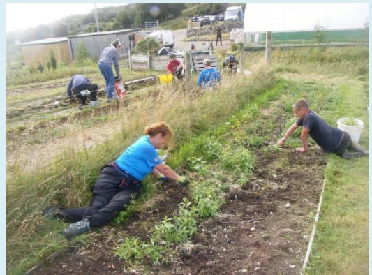
Above Weeding at the CALL (Coigach Assynt Living Landscape) tree nursery, middle planting a brash hedge at Corrour, below hanging a gate on the Corrour brash hedge