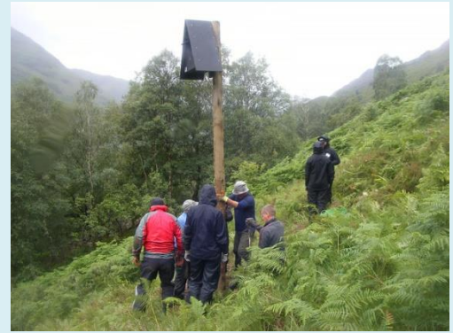
Above installing an owl box in Glen Nevis below (!) getting public to help carry rubbish out from Sandwood Bay (r) drystone wall repairs on Tanera Mor